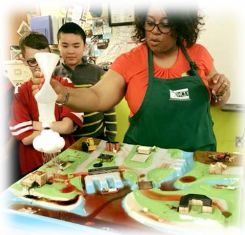
Educational Classroom Programs Enviroscape