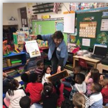
Outreach Agriculture Education