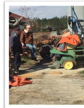
Brickhouse Farms Tire Days!