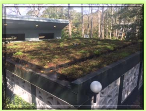
Rain Garden, Virginia Beach VCAP

The Districts completed 30 projects in Virginia Beach and Chesapeake on Impervious Surface Removal, Permeable Pavement, Rain Gardens ,Dry Wells, and a Green Roof were approved For a combined dollar amount of $ Funding is provided through The Virginia Association of Soil and Water Conservation District (VASWCD).