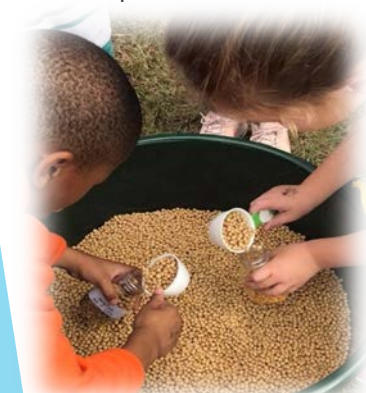
Crop Art, Farm Days

Virginia Dare hosted over 1800 1 st grade students and 61 classrooms for 4 days of Farms Days in Virginia Beach and Chesapeake! Each student received outreach educational material and goodies from our Agriculture Partners! Virginia Beach Farm Days was held at Hunt Club Farms. Chesapeake Farm Days was held at Triple R. Ranch. Thank you to all of our Sponsors!