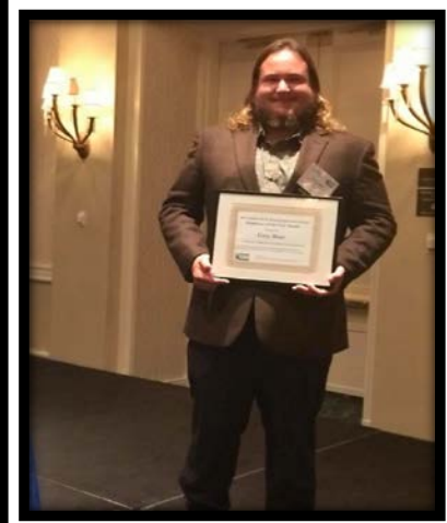
VASWCD Employee of The Year!