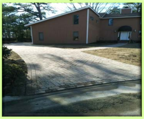
Permeable Pavement, Virginia Beach, VCAP