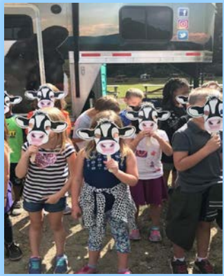
Dairy Stop Farm Days