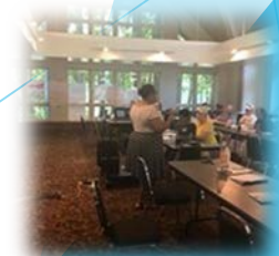
Virginia Environmental Science Educators Workshop

Virginia Dare SWCD presented Adult Education at Teacher Workshops and Partner Workshops.