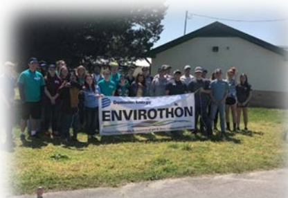
VASWCD State Envirothon, VSU